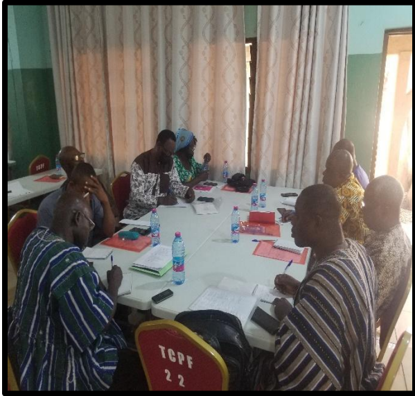
Navrongo/Bolgatanga Diocese Group Work

Below is a cross-section of pictures of the Diocesan discussions