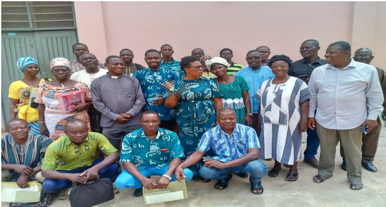
Participants after the Partnership meeting in the Wa Diocese