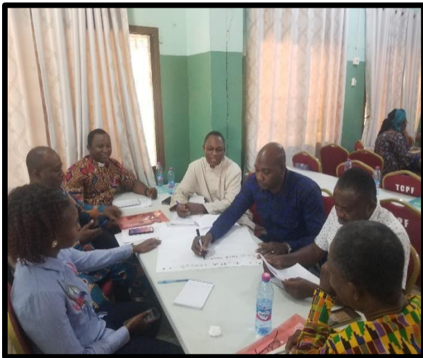
Tamale Archdiocese Diocese