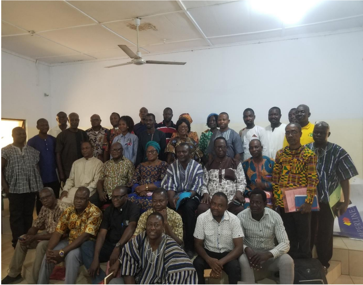
Partnership Workshop Participants