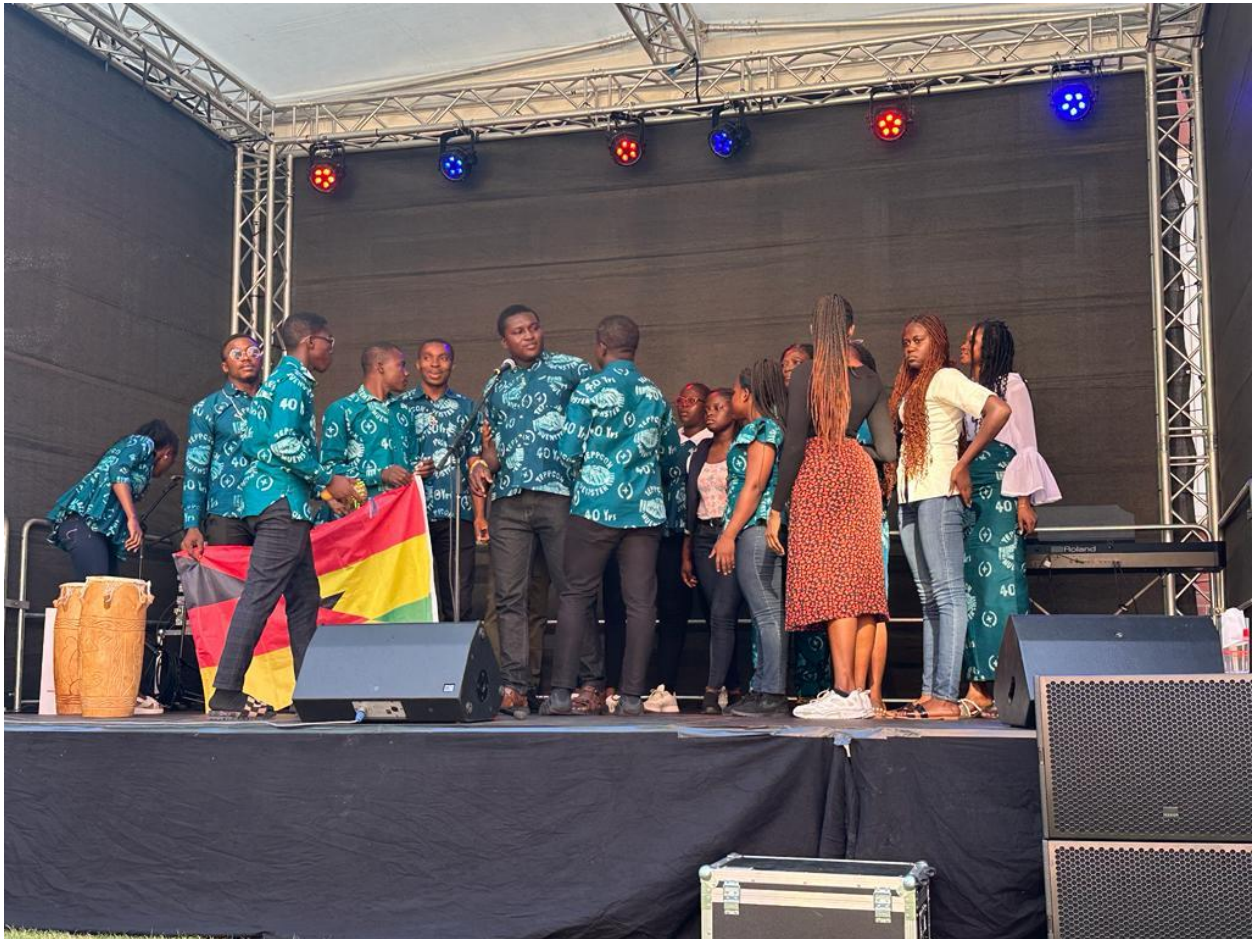
The Ghanaian University students preparing to display a cultural dance