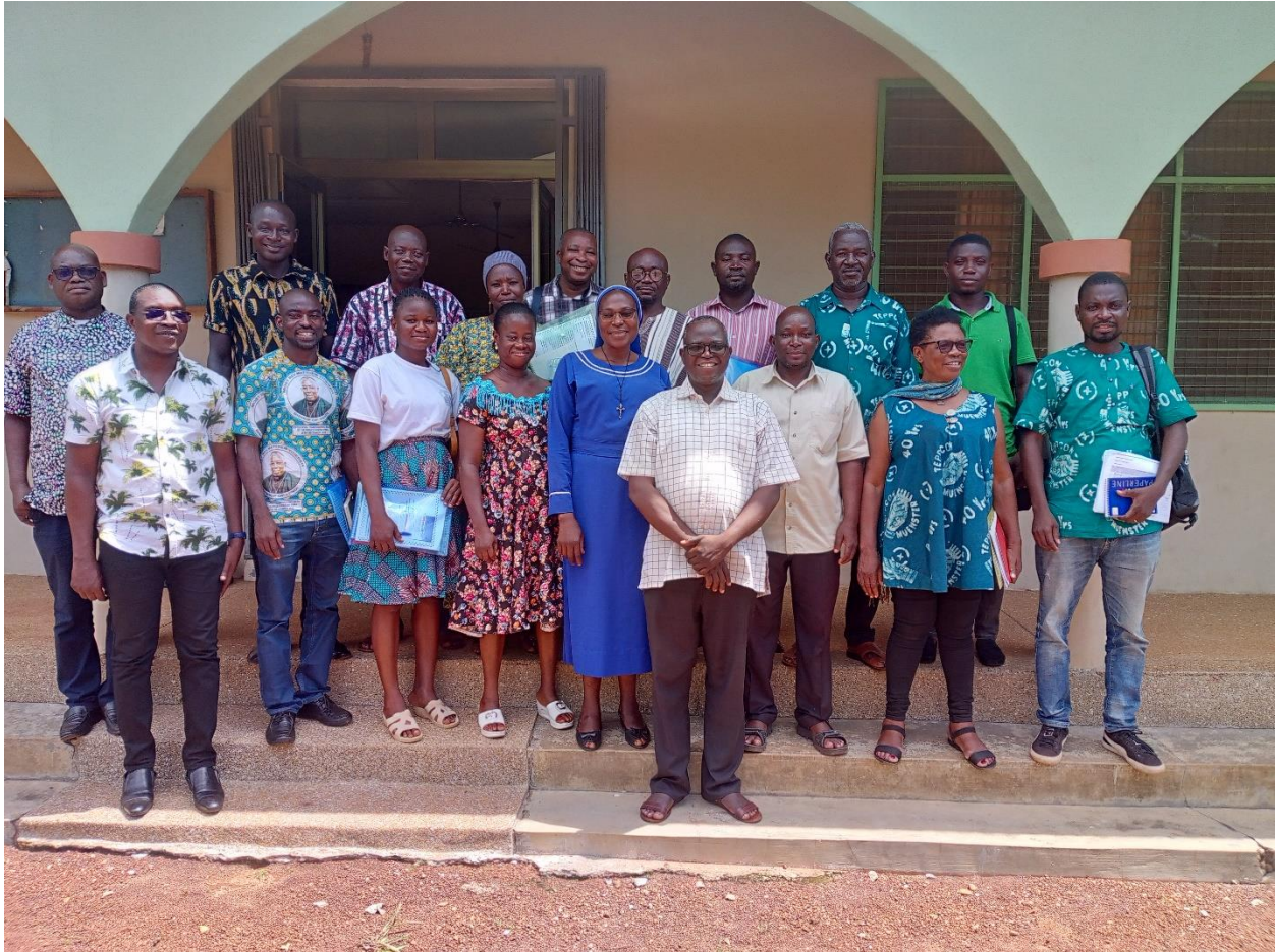
Picture after the meeting