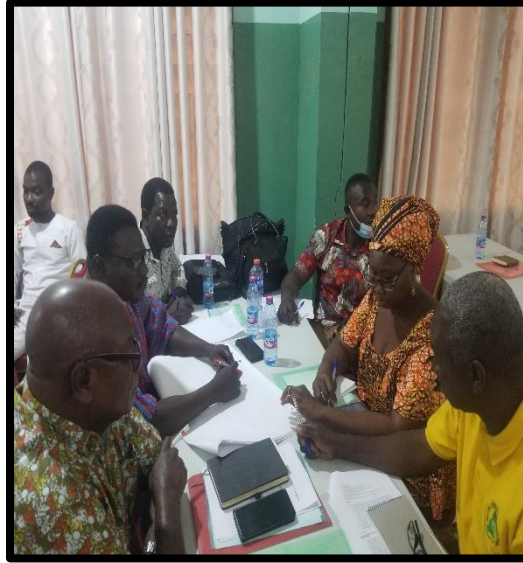
Yendi Diocese Group Work